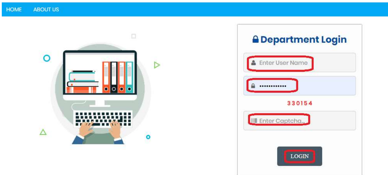
Figure 2 : Login details