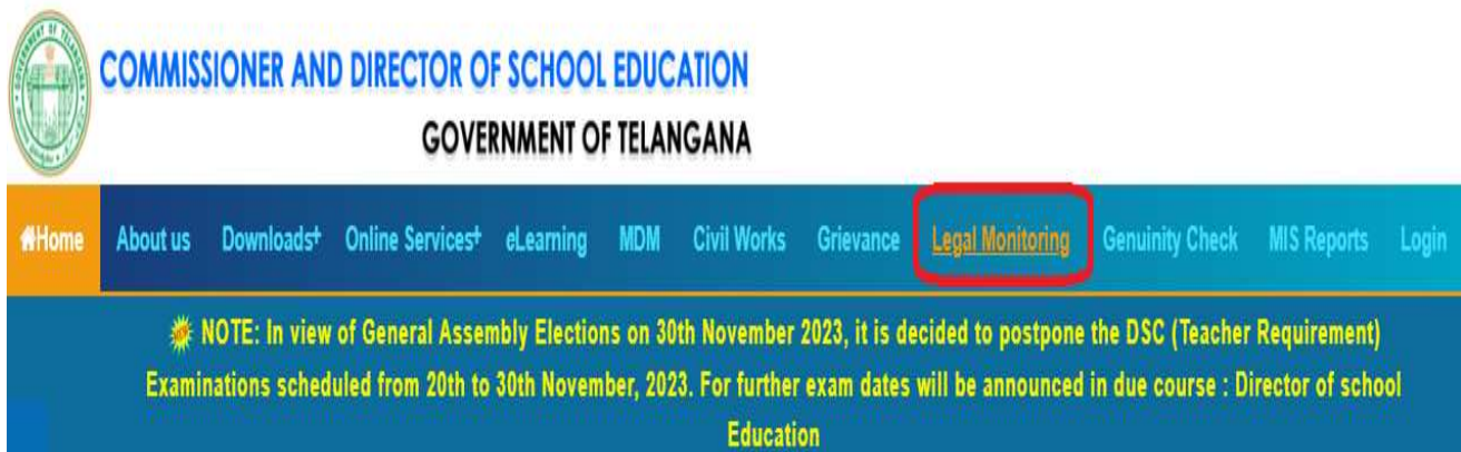
Figure 1 : Service details