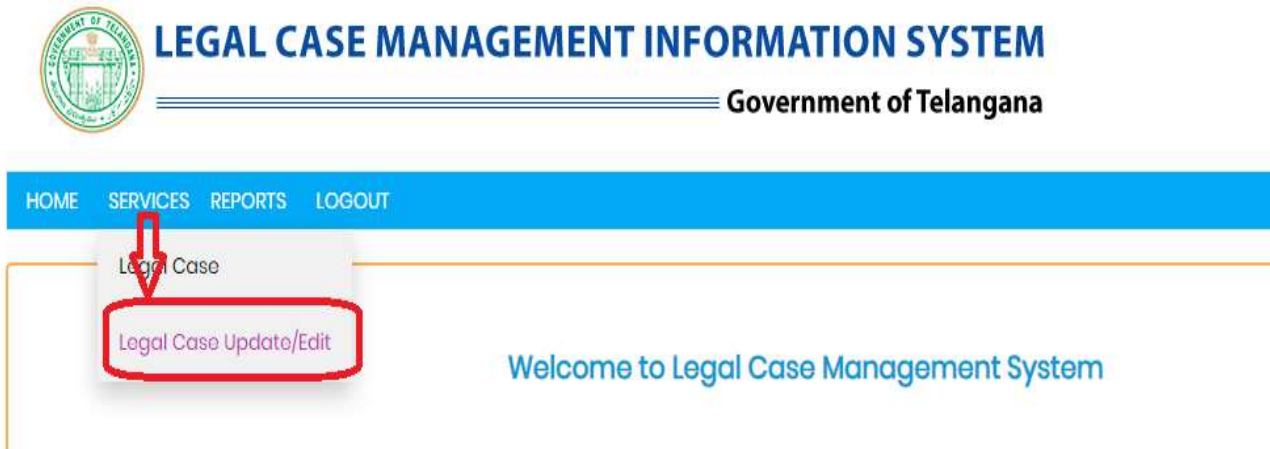
Figure 3 : Legal Case Update/Edit service